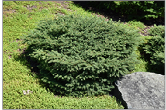
Birds Nest Spruce