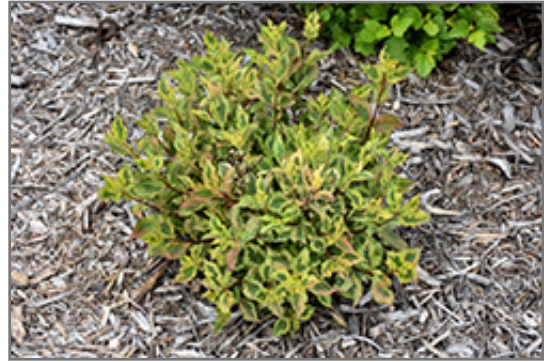
Rainbow Sensation Weigela

Rainbow Sensation Weigela makes a fine choice for the outdoor landscape, but it is also well-suited for use in outdoor pots and containers. Because of its height, it is often used as a 'thriller' in the 'spiller-thriller-filler' container combination; plant it near the center of the pot, surrounded by smaller plants and those that spill over the edges. It is even sizeable enough that it can be grown alone in a suitable container. Note that when grown in a container, it may not perform exactly as indicated on the tag - this is to be expected. Also note that when growing plants in outdoor containers and baskets, they may require more frequent waterings than they would in the yard or garden.