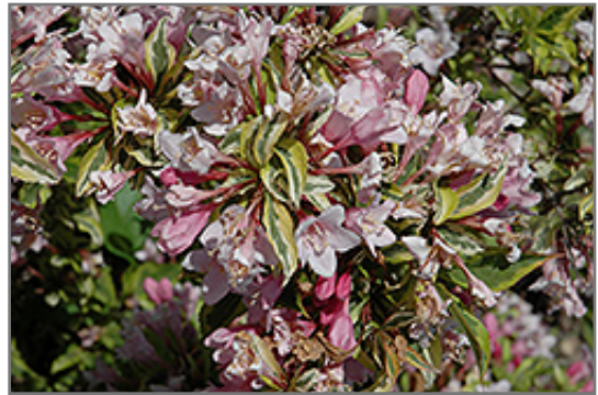
Rainbow Sensation Weigela flowers

Rainbow Sensation Weigela is recommended for the following landscape applications;