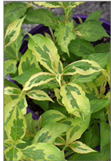
My Monet Sunset Weigela foliage

My Monet Sunset Weigela is recommended for the following landscape applications;