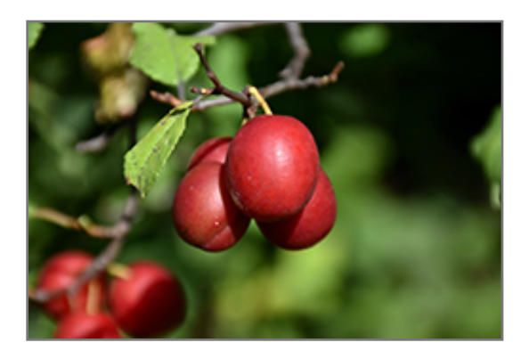
Toka Plum fruit