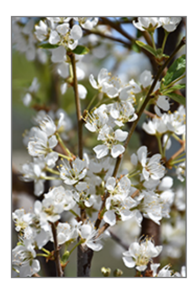
Toka Plum flowers

Begick Nursery 5993 West Side Saginaw Rd. Bay City, MI 48706 989.684.4210