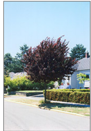
Newport Plum