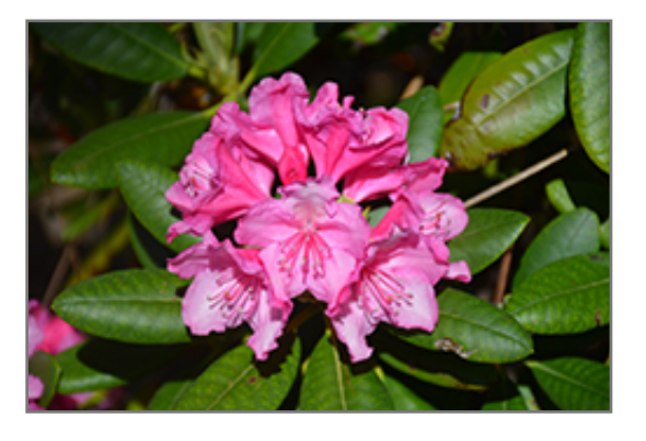
Haaga Rhododendron flowers

A relatively new broadleaf evergreen shrub with rich deep pink flowers in spring, coarse dark foliage and an upright mounded habit, quite hardy; absolutely must have well-drained, highly acidic and organic soil, use plenty of peat moss when planting