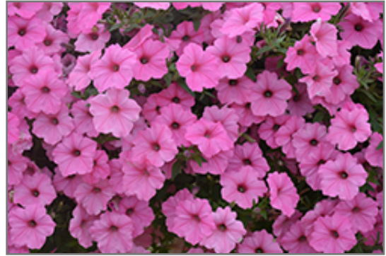
Supertunia Vista Bubblegum Petunia flowers