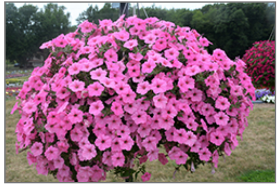
Supertunia Vista Bubblegum Petunia in bloom

This plant should only be grown in full sunlight. It does best in average to evenly moist conditions, but will not tolerate standing water. It is not particular as to soil type or pH. It is highly tolerant of urban pollution and will even thrive in inner city environments. This particular variety is an interspecific hybrid. It can be propagated by cuttings; however, as a cultivated variety, be aware that it may be subject to certain restrictions or prohibitions on propagation.