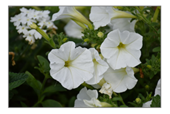
Supertunia White Petunia flowers

Begick Nursery 5993 West Side Saginaw Rd. Bay City, MI 48706 989.684.4210