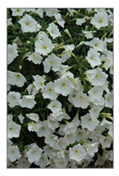
Supertunia White Petunia flowers