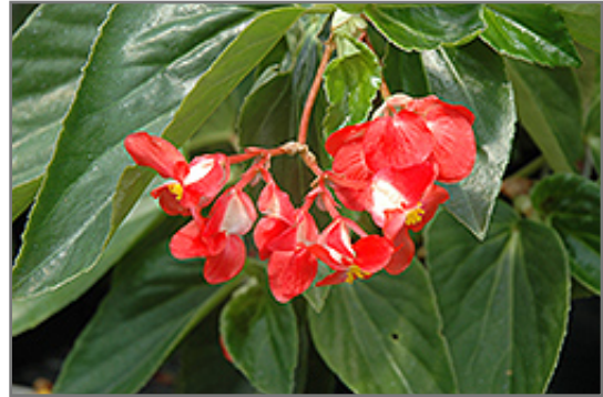
Dragon Wing Red Begonia flowers

Dragon Wing Red Begonia is recommended for the following landscape applications;