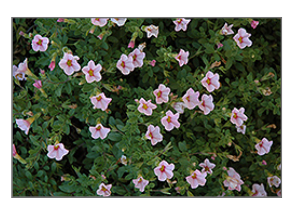
Superbells Cherry Blossom Calibrachoa flowers

Superbells Cherry Blossom Calibrachoa is recommended for the following landscape applications;