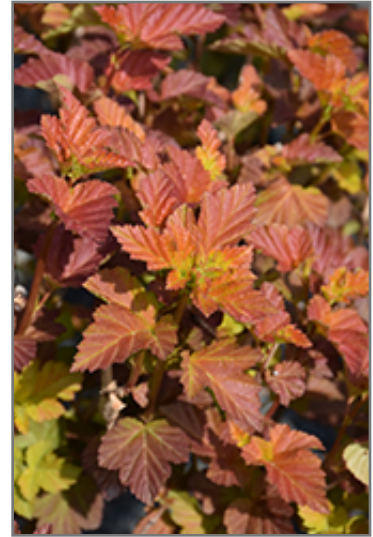
Amber Jubilee Ninebark foliage

This shrub will require occasional maintenance and upkeep, and can be pruned at anytime. It has no significant negative characteristics.