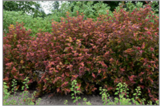
Amber Jubilee Ninebark

This shrub does best in full sun to partial shade. It is very adaptable to both dry and moist locations, and should do just fine under average home landscape conditions. It is not particular as to soil type or pH. It is highly tolerant of urban pollution and will even thrive in inner city environments. This is a selection of a native North American species.