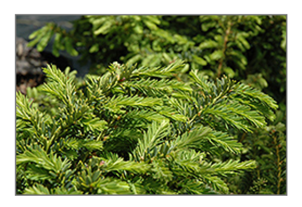
Emerald Spreader Yew foliage