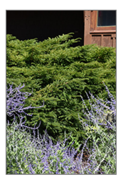
Emerald Spreader Yew