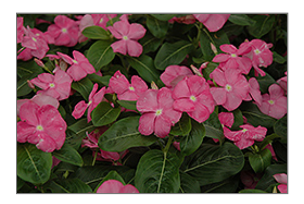
Titan Rose Vinca flowers