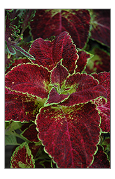
ColorBlaze Dipt in Wine Coleus foliage