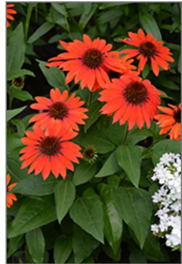
Sombbrero Flamenco Orange Coneflower in bloom

Sombbrero Flamenco Orange Coneflower is recommended for the following landscape applications;