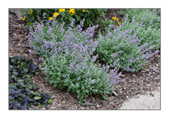
Purrsian Blue Catmint in bloom

Purrsian Blue Catmint is recommended for the following landscape applications;