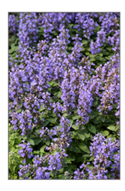
Purrsian Blue Catmint flowers