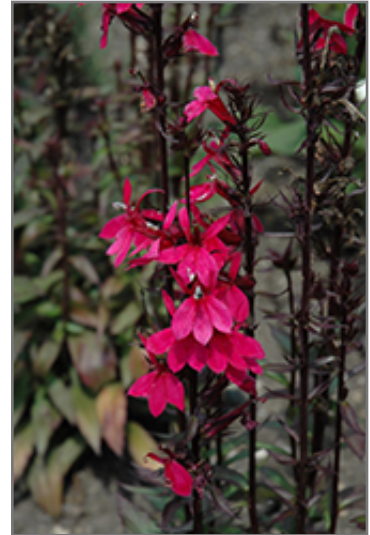
Starship Deep Rose Lobelia flowers

Starship Deep Rose Lobelia is recommended for the following landscape applications;