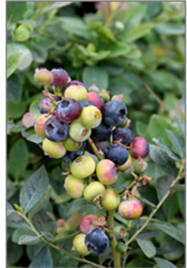
Pink Icing Blueberry fruit

Pink Icing Blueberry features dainty clusters of white bell-shaped flowers with shell pink overtones hanging below the branches in mid spring, which emerge from distinctive pink flower buds. It has bluish-green deciduous foliage which emerges pink in spring. The glossy oval leaves turn an outstanding aqua bluish-green in the fall. It features an abundance of magnificent blue berries in mid summer.