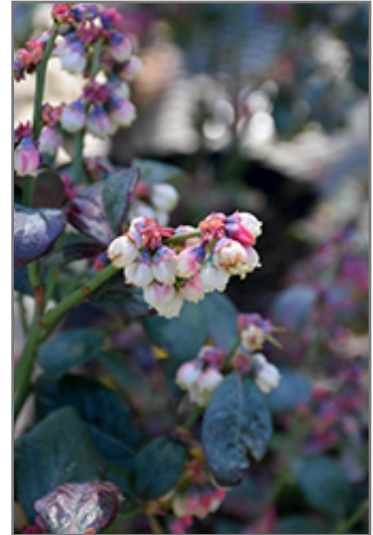
Pink Icing Blueberry flowers

This shrub is quite ornamental as well as edible, and is as much at home in a landscape or flower garden as it is in a designated edibles garden. It does best in full sun to partial shade. It does best in average to evenly moist conditions, but will not tolerate standing water. It is very fussy about its soil conditions and must have sandy, acidic soils to ensure success, and is subject to chlorosis (yellowing) of the foliage in alkaline soils. It is quite intolerant of urban pollution, therefore inner city or urban streetside plantings are best avoided, and will benefit from being planted in a relatively sheltered location. Consider applying a thick mulch around the root zone in winter to protect it in exposed locations or colder microclimates. This particular variety is an interspecific hybrid.