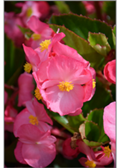
Big Pink Green Leaf Begonia flowers

This is a high maintenance plant that will require regular care and upkeep, and usually looks its best without pruning, although it will tolerate pruning. Deer don't particularly care for this plant and will usually leave it alone in favor of tastier treats. Gardeners should be aware of the following characteristic(s) that may warrant special consideration;