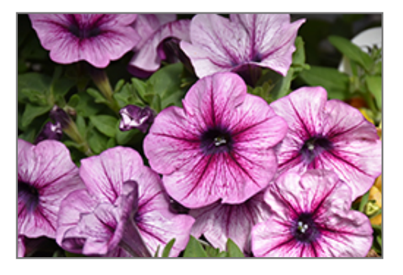
Starlet Lavender Star Petunia flowers

Starlet Lavender Star Petunia is recommended for the following landscape applications;