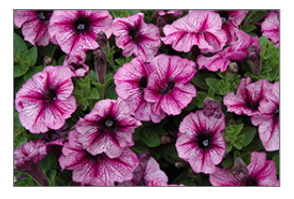
Starlet Lavender Star Petunia flowers

Begick Nursery 5993 West Side Saginaw Rd. Bay City, MI 48706 989.684.4210