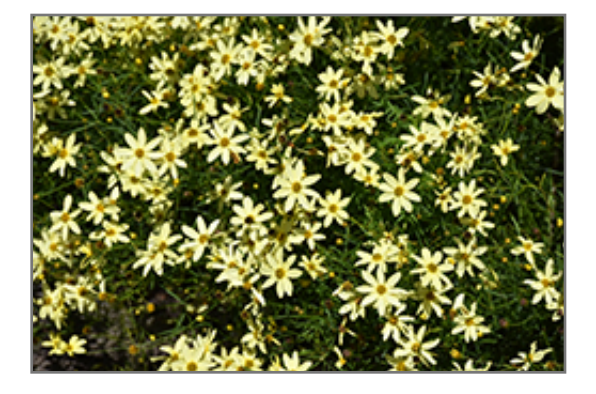
Moonbeam Tickseed flowers

Begick Nursery 5993 West Side Saginaw Rd. Bay City, MI 48706 989.684.4210