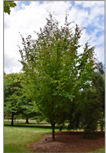
Ruby Vase Parrotia