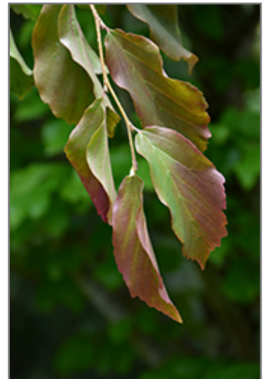
Ruby Vase Parrotia foliage