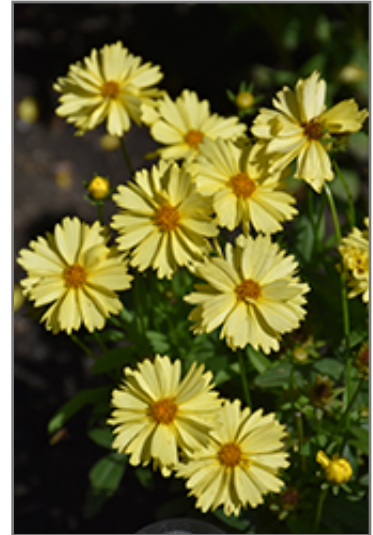
Leading Lady Lauren Tickseed flowers