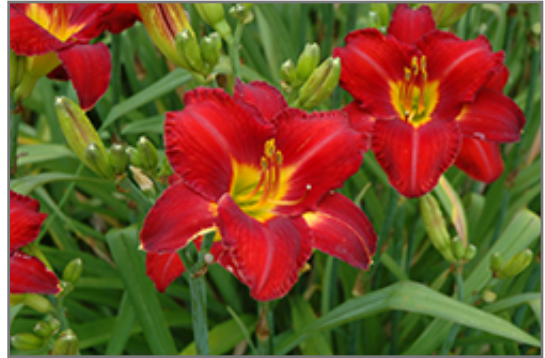
Chicago Apache Daylily flowers

Rich scarlet red flowers with slightly ruffled edges bloom during the mid summer months; tall flower stalks rise above mounds of green arching foliage; an elegant addition to borders, beds and containers; low maintenance and drought tolerant