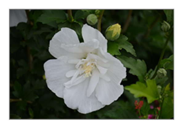
White Pillar Rose of Sharon flowers