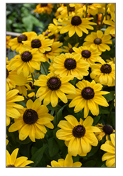
Toto Lemon Coneflower flowers