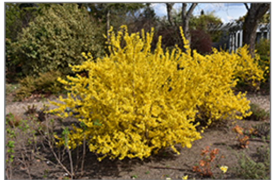
Magical Gold Forsythia in bloom