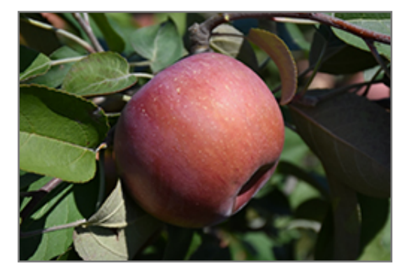
SnowSweet Apple fruit

Begick Nursery 5993 West Side Saginaw Rd. Bay City, MI 48706 989.684.4210