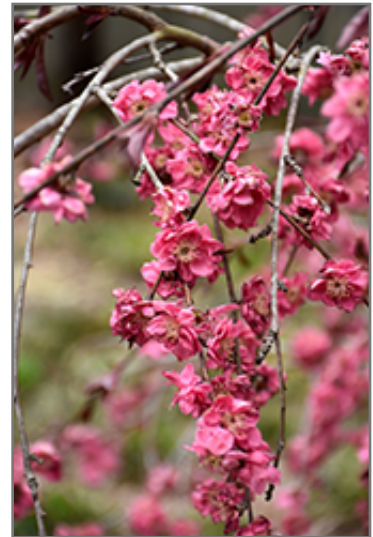
Crimson Cascade Weeping Peach flowers

Crimson Cascade Weeping Peach is recommended for the following landscape applications;