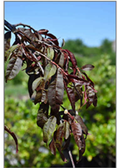
Crimson Cascade Weeping Peach foliage

This tree should only be grown in full sunlight. It does best in average to evenly moist conditions, but will not tolerate standing water. It is not particular as to soil type or pH. It is highly tolerant of urban pollution and will even thrive in inner city environments, and will benefit from being planted in a relatively sheltered location. This is a selected variety of a species not originally from North America.