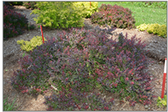
Sunjoy Todo Japanese Barberry

Sunjoy Todo Japanese Barberry will grow to be about 24 inches tall at maturity, with a spread of 24 inches. It tends to fill out right to the ground and therefore doesn't necessarily require facer plants in front. It grows at a medium rate, and under ideal conditions can be expected to live for approximately 20 years.