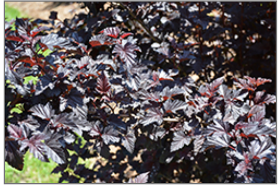
Summer Wine Black Ninebark foliage