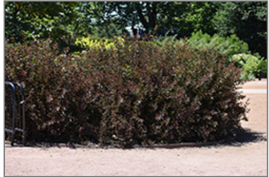
Summer Wine Black Ninebark