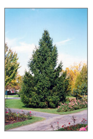
Norway Spruce