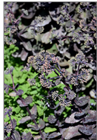
Night Light Stonecrop flowers