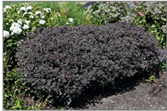
Night Light Stonecrop in bloom

Night Light Stonecrop is recommended for the following landscape applications;