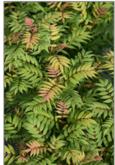
Mr. Mustard False Spirea foliage