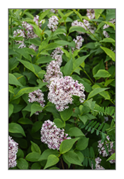
Baby Kim Lilac flowers