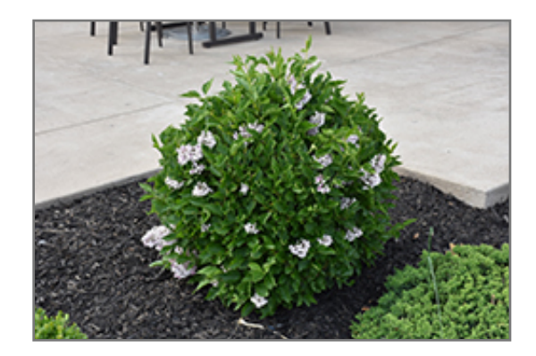
Baby Kim Lilac in bloom