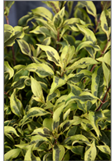
Bubbly Wine Weigela foliage

Bubbly Wine Weigela is recommended for the following landscape applications;