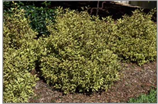
Bubbly Wine Weigela

Bubbly Wine Weigela will grow to be about 24 inches tall at maturity, with a spread of 3 feet. It tends to fill out right to the ground and therefore doesn't necessarily require facer plants in front. It grows at a medium rate, and under ideal conditions can be expected to live for approximately 30 years.