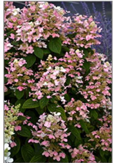
Quick Fire Hydrangea flowers