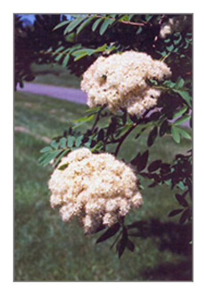
European Mountain Ash flowers

This tree should only be grown in full sunlight. It is very adaptable to both dry and moist locations, and should do just fine under average home landscape conditions. It is not particular as to soil type or pH. It is highly tolerant of urban pollution and will even thrive in inner city environments. This species is not originally from North America.