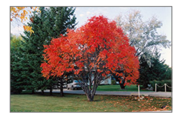
European Mountain Ash in fall

European Mountain Ash is recommended for the following landscape applications;