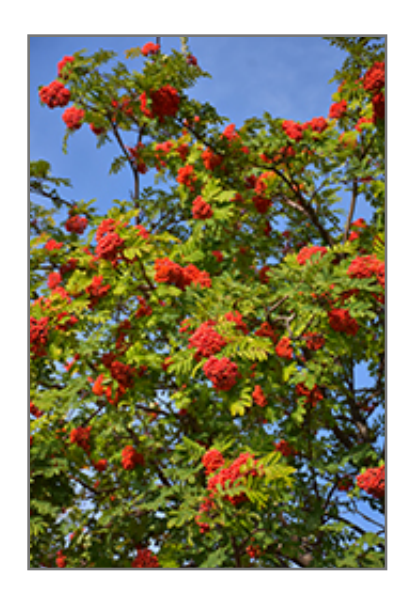
European Mountain Ash fruit

Begick Nursery 5993 West Side Saginaw Rd. Bay City, MI 48706 989.684.4210