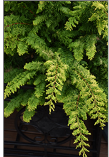
Fernspray Gold Falsecypress foliage