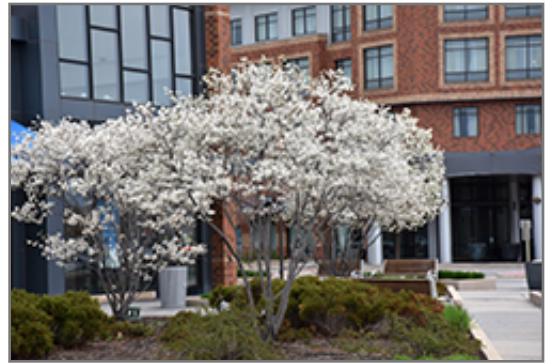
Autumn Brilliance Serviceberry in bloom

Autumn Brilliance Serviceberry is recommended for the following landscape applications;