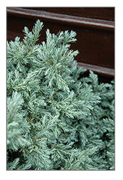
Baby Blue Moss Falsecypress foliage