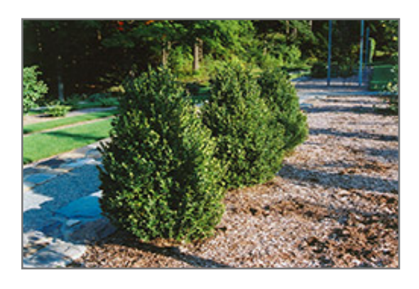
Green Mountain Boxwood

This is a relatively low maintenance shrub, and can be pruned at anytime. It is a good choice for attracting bees to your yard, but is not particularly attractive to deer who tend to leave it alone in favor of tastier treats. It has no significant negative characteristics.