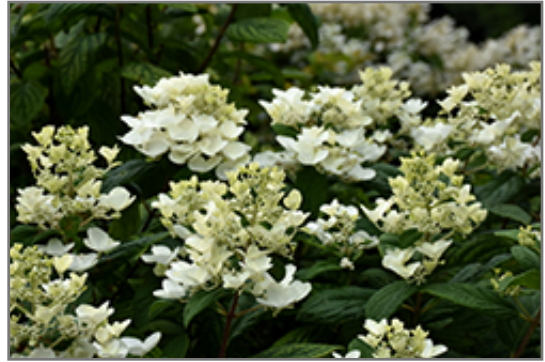
White Diamonds Hydrangea flowers

This shrub performs well in both full sun and full shade. It prefers to grow in average to moist conditions, and shouldn't be allowed to dry out. It is not particular as to soil type or pH. It is highly tolerant of urban pollution and will even thrive in inner city environments. Consider applying a thick mulch around the root zone in winter to protect it in exposed locations or colder microclimates. This is a selected variety of a species not originally from North America.