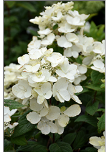
White Diamonds Hydrangea flowers