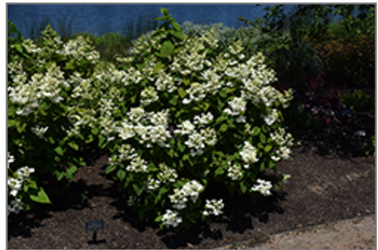
White Diamonds Hydrangea in bloom