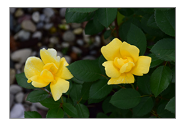
Sunny Knock Out Rose flowers