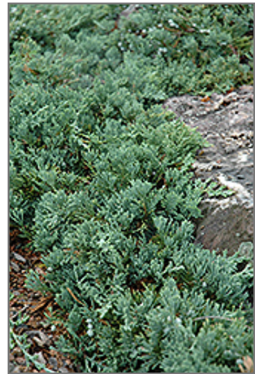
Blue Rug Juniper