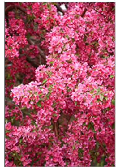
Prairifire Flowering Crab flowers