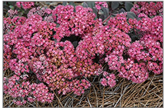
Dazzleberry Stonecrop flowers

Dazzleberry Stonecrop is a dense herbaceous perennial with an upright spreading habit of growth. Its medium texture blends into the garden, but can always be balanced by a couple of finer or coarser plants for an effective composition.