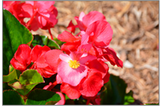
Whopper Rose Green Leaf Begonia flowers

This is a high maintenance plant that will require regular care and upkeep, and usually looks its best without pruning, although it will tolerate pruning. Deer don't particularly care for this plant and will usually leave it alone in favor of tastier treats. Gardeners should be aware of the following characteristic(s) that may warrant special consideration;