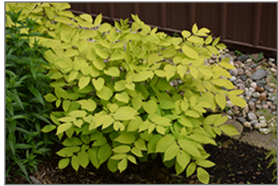
Sun King Japanese Spikenard