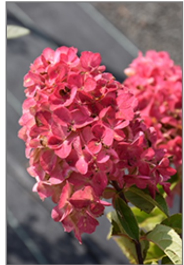
Fire Light Hydrangea flowers